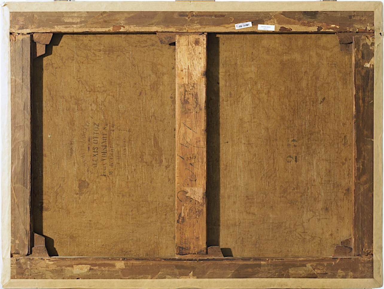
Fig. 2: Overall view of the reverse, with the canvas maker's stamp Voisinot, Paris; on the right, with the stamp indicating the size '25'.