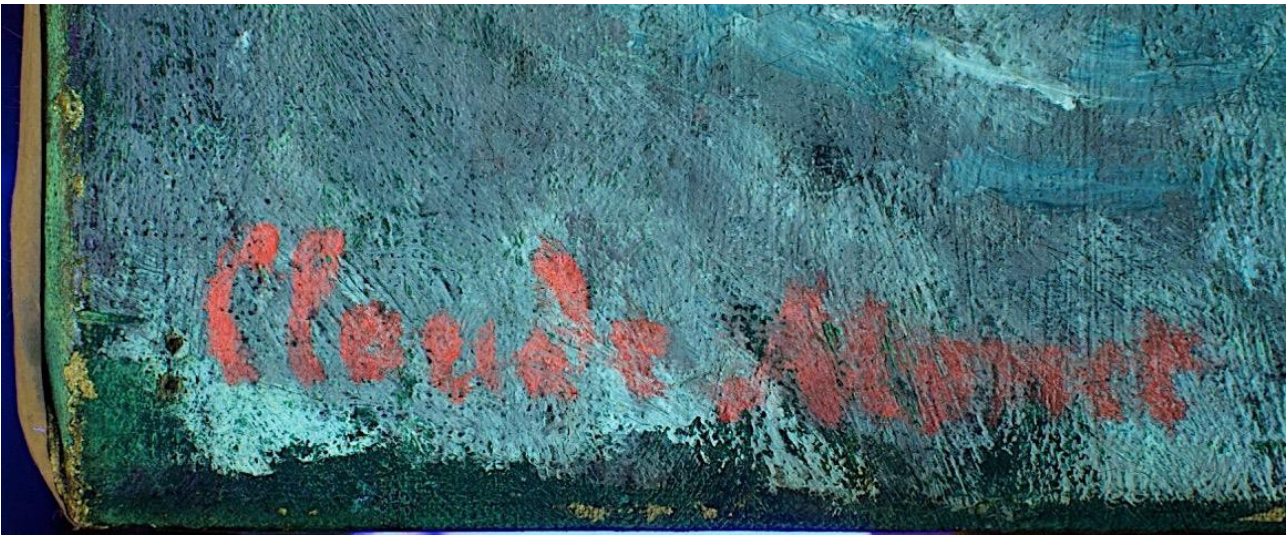
Fig. 6b: Signature, with the artist's pin holes under ultraviolet light.