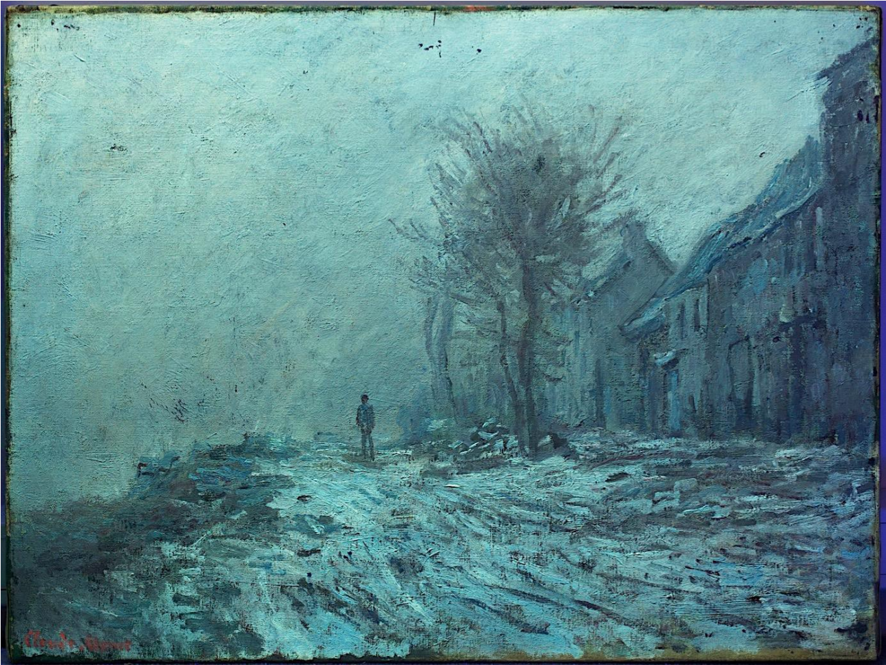
Fig. 4: Overall view under ultraviolet light.