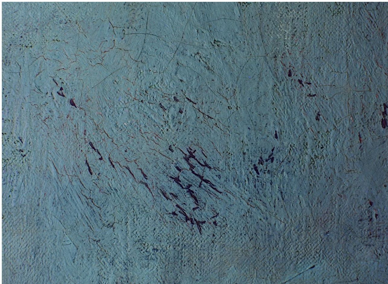
Fig. 9: Detail under ultraviolet light, half way on the left : small spots of retouching in the craquelure.