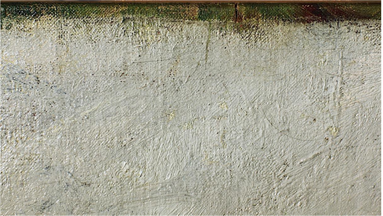
Fig. 7a: Detail of the center of the upper edge.