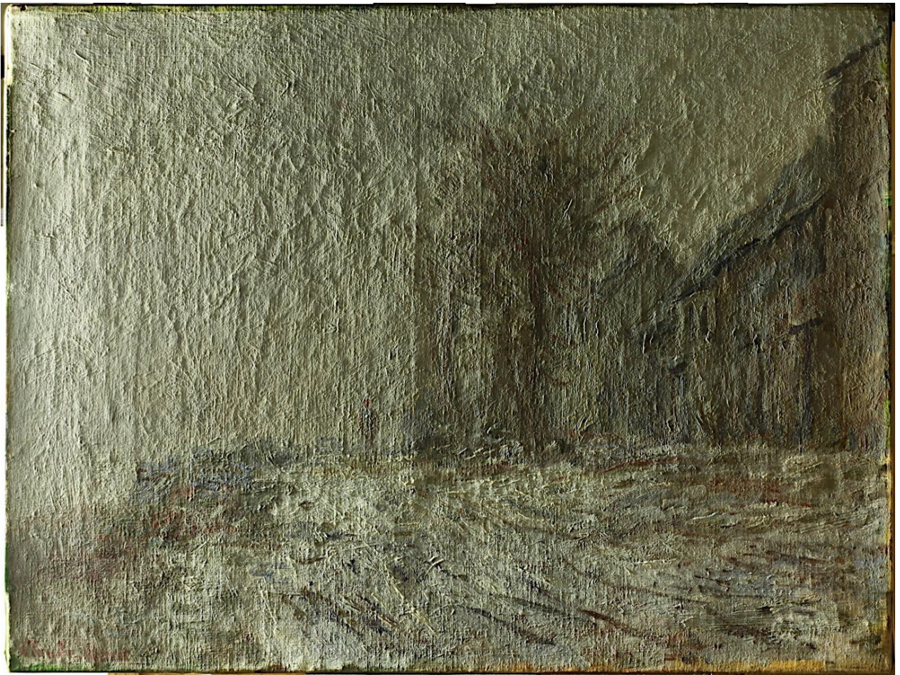
Fig. 3: Overall view under raking light.