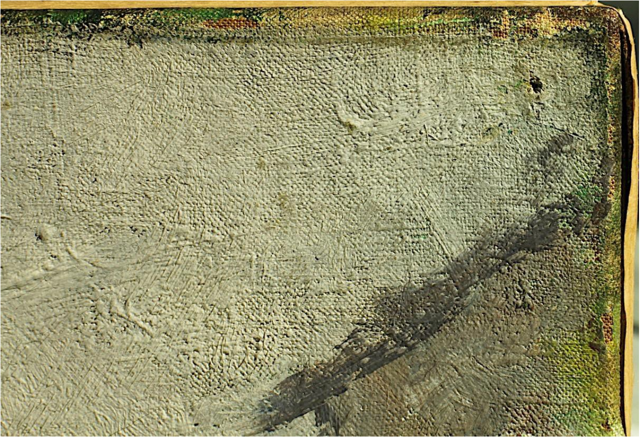
Fig. 8a: Detail of the upper right corner with the artist's pin holes.