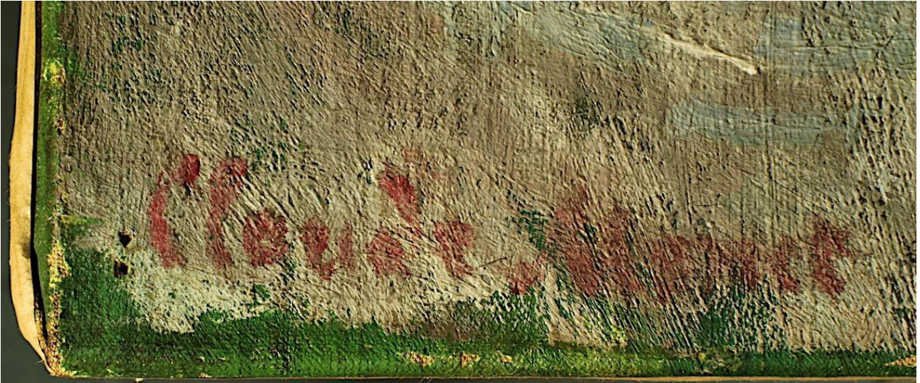
Fig. 6a: Signature, with the artist's pin holes on the left.