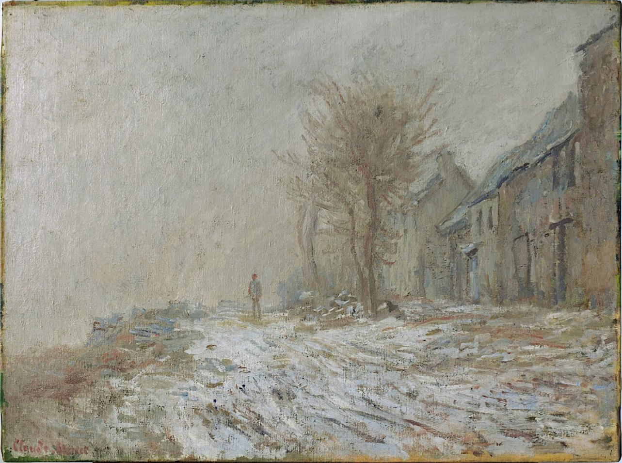
Fig. 1: La berge de Lavacourt sous la neige , overall view.