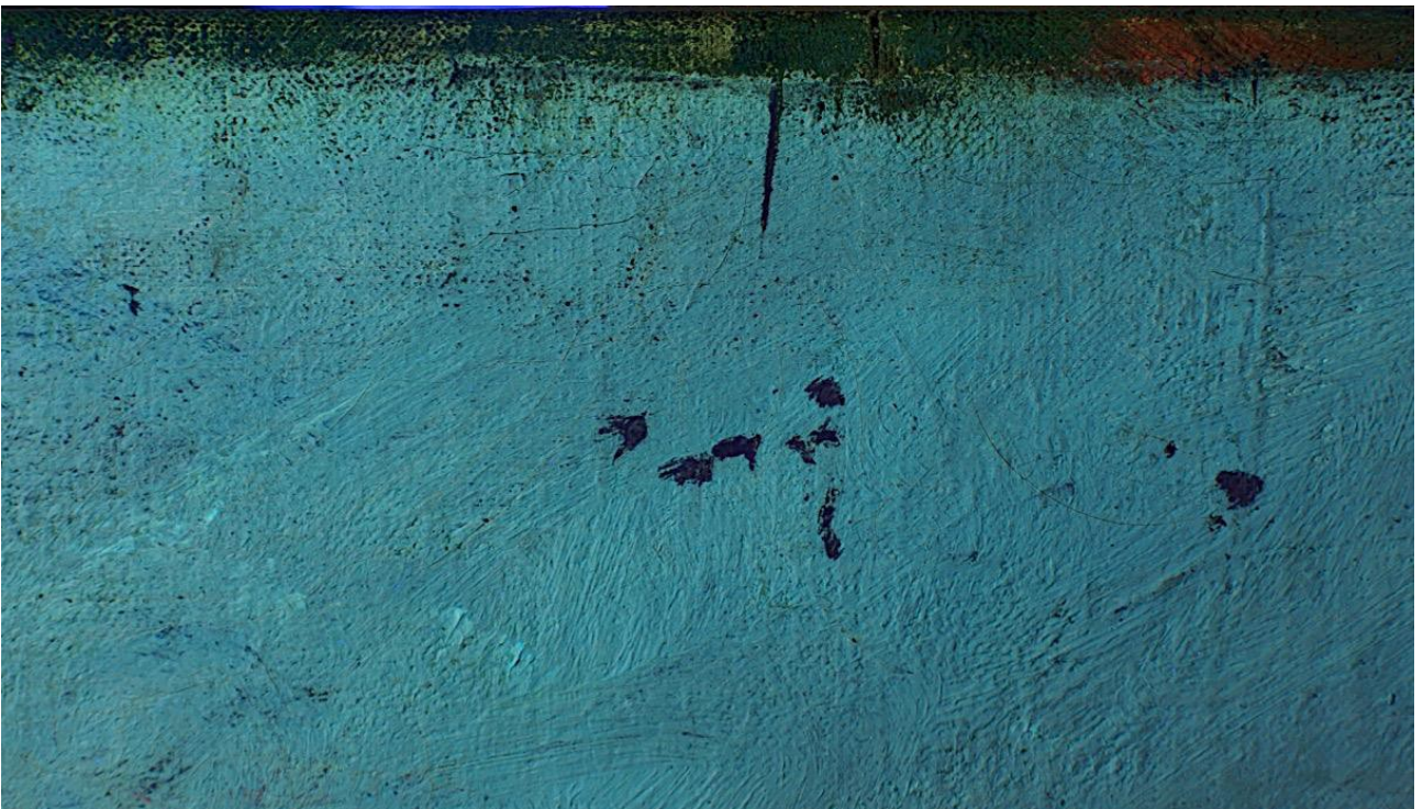
Fig. 7b: Detail of the center of the upper edge under ultraviolet light.