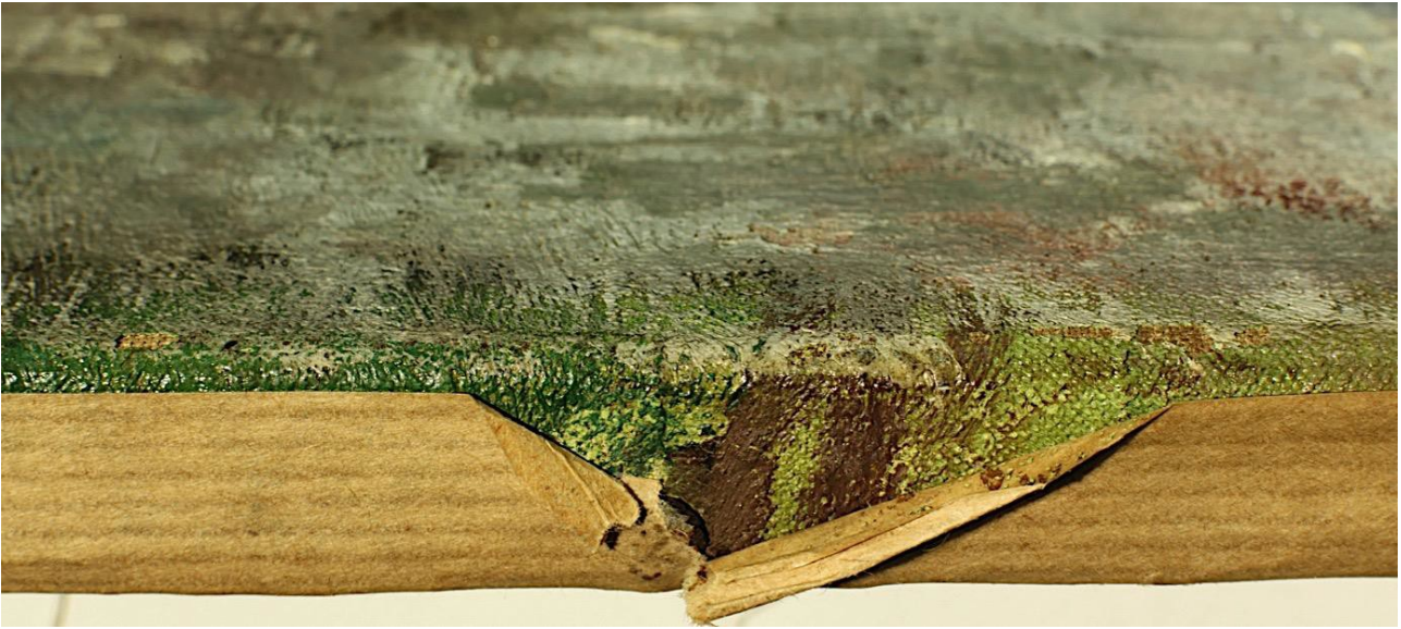
Fig. 5: Detail of the lower left edge; underlying composition.